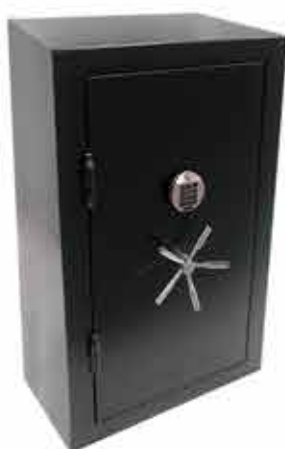
Item No.: LBL-QG106 Size: 66cm x 46cm x 106cm