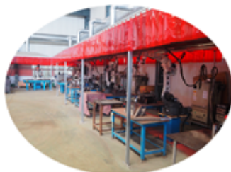
Automatic welding Robots 全自动焊接机器人