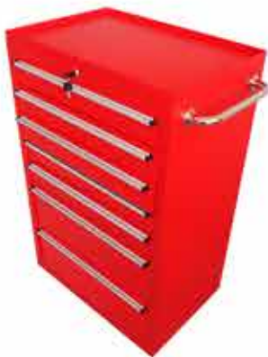
Item No.: LBL-TC02 Size: 69cm x 46cm x 107cm