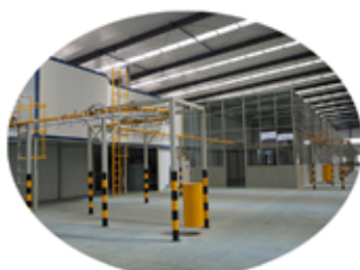
Powder Coating Line/粉末涂装线