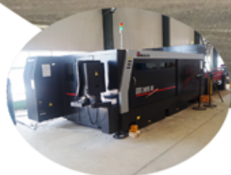
Automatic sheet metal cutting 全自动钣金切割