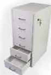
Item No.: TCG-6022 Size: 28cm x 41cm x 69cm