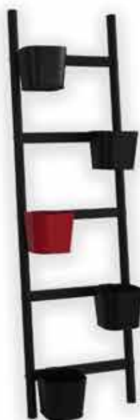
Item No.: ZHJ-019 Size: 36cm x 125cm