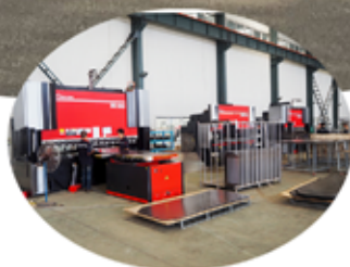
CNC bending machine/数控折弯机