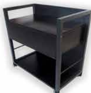
Item No.: TBZ-031 Size: 69.5cm x 70cm x 69.5cm