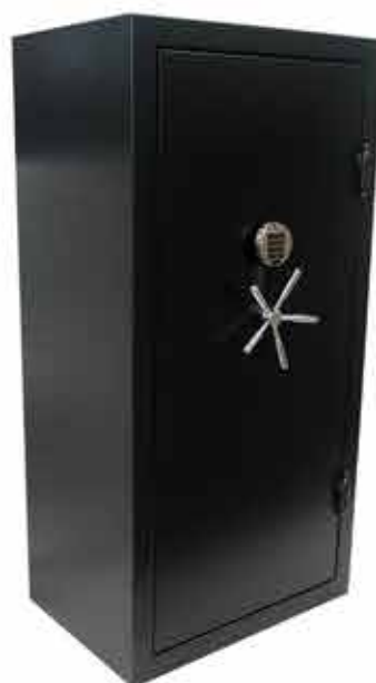
Item No.: LBL-QG150 Size: 74.7cm x 50cm x 147.7cm