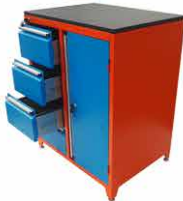
Item No.: LBL-TC12 Size: 80cm x 60cm x 103cm