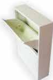
Item No.: TZJ-027 Size: 51cm x 15.3cm x 70cm