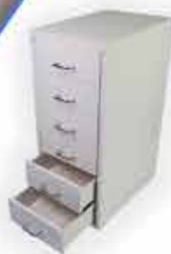
Item No.: TCG-6021 Size: 28cm x 41cm x 69cm