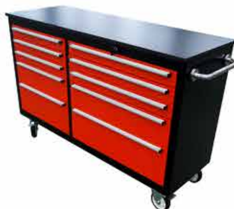
Item No.: LBL-TC05 Size: 140cm x 46cm x 95cm