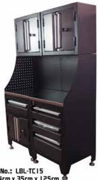
Item No.: LBL-TC15 Size: 80.4cm x 35cm x 125cm