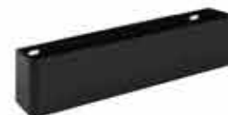
I Size: 30.4cmx7.2cmx5.1cm