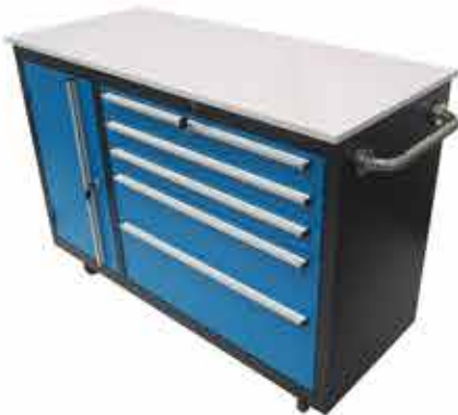
Item No.: LBL-TC01 Size: 120cm x 46cm x 95cm