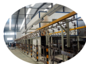
Electrophoretic coating Line 电泳车间