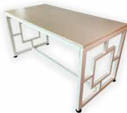
Item No.: TJZ-028 Size: 150cm x 75cm x 77.5cm