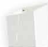
F Size: 27cmx21cmx16cmx10cmx6cm