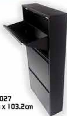
Item No.: TZJ-027 Size: 51cm x 15.3cm x 103.2cm