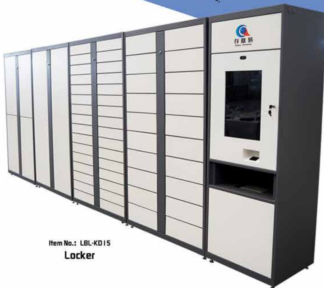
Item No.: LBL-KD15 Locker

We have been working with some famous Logistics Companies on this Parcel Delivery Locker since 2017. Our production ability is currently 100-200sets/day since we are equipped with a complete production line including Cutting, Punching, Bending, Welding Robots, Electro-coating, and Power Coating. OEM & ODM are available, we can design according your request.