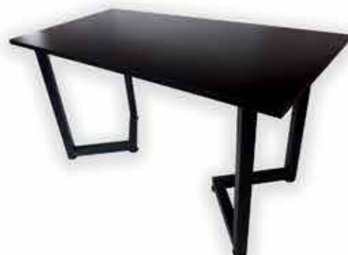
Item No.: TJZ-029 Size: 150cm x 75cm x 77.5cm