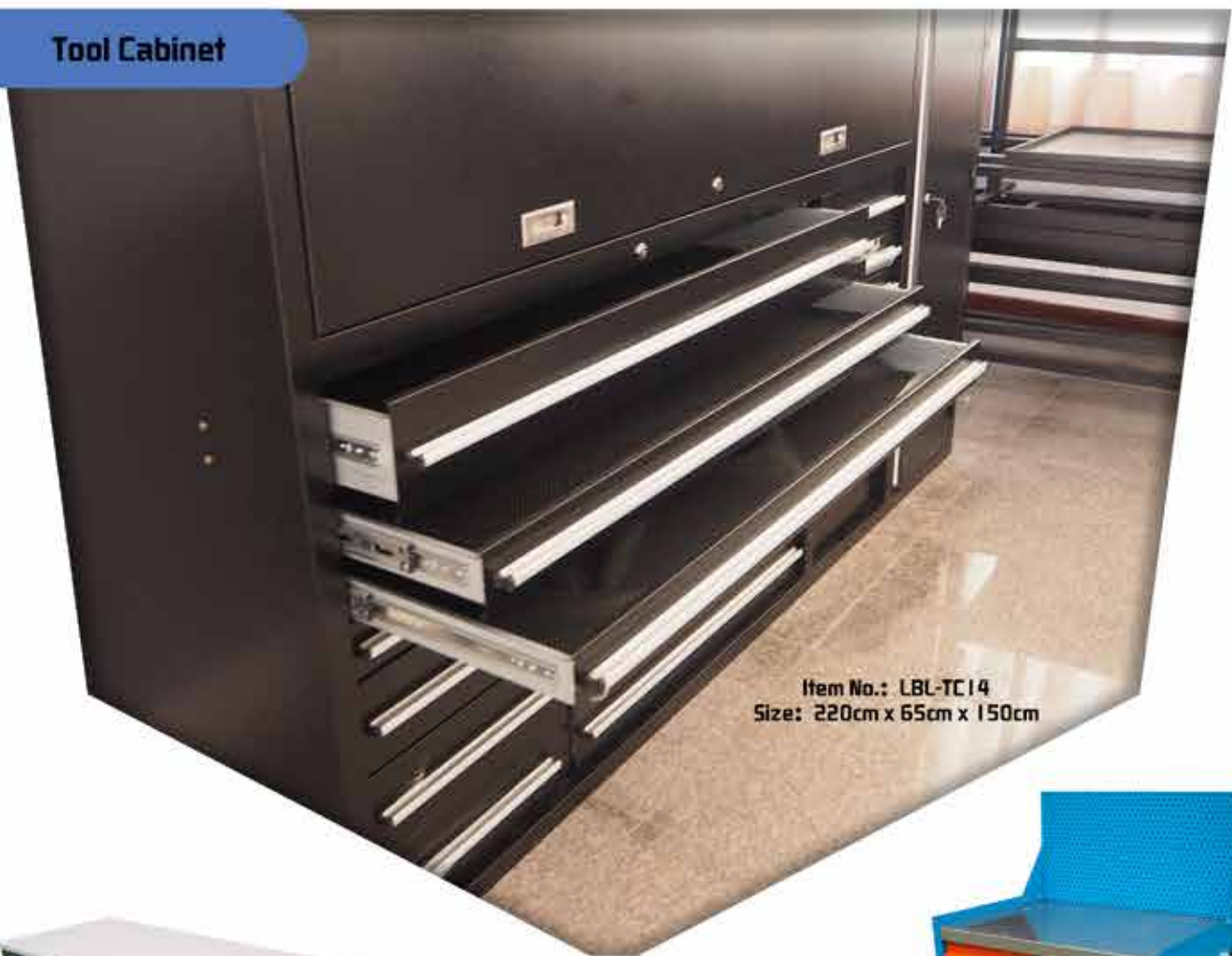
Item No.: LBL-TC14 Size: 220cm x 65cm x 150cm