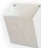
A Size: 20cmx25cmx19.5cmx12cm