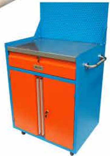
Item No.: LBL-TC13 Size: 80cm x 60cm x 148cm