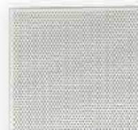
Item No.: TDB-009 Size: 53.5cm x 53.5cm