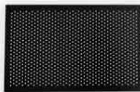
Item No.: TDB-010 Size: 53.5cm x 74cm