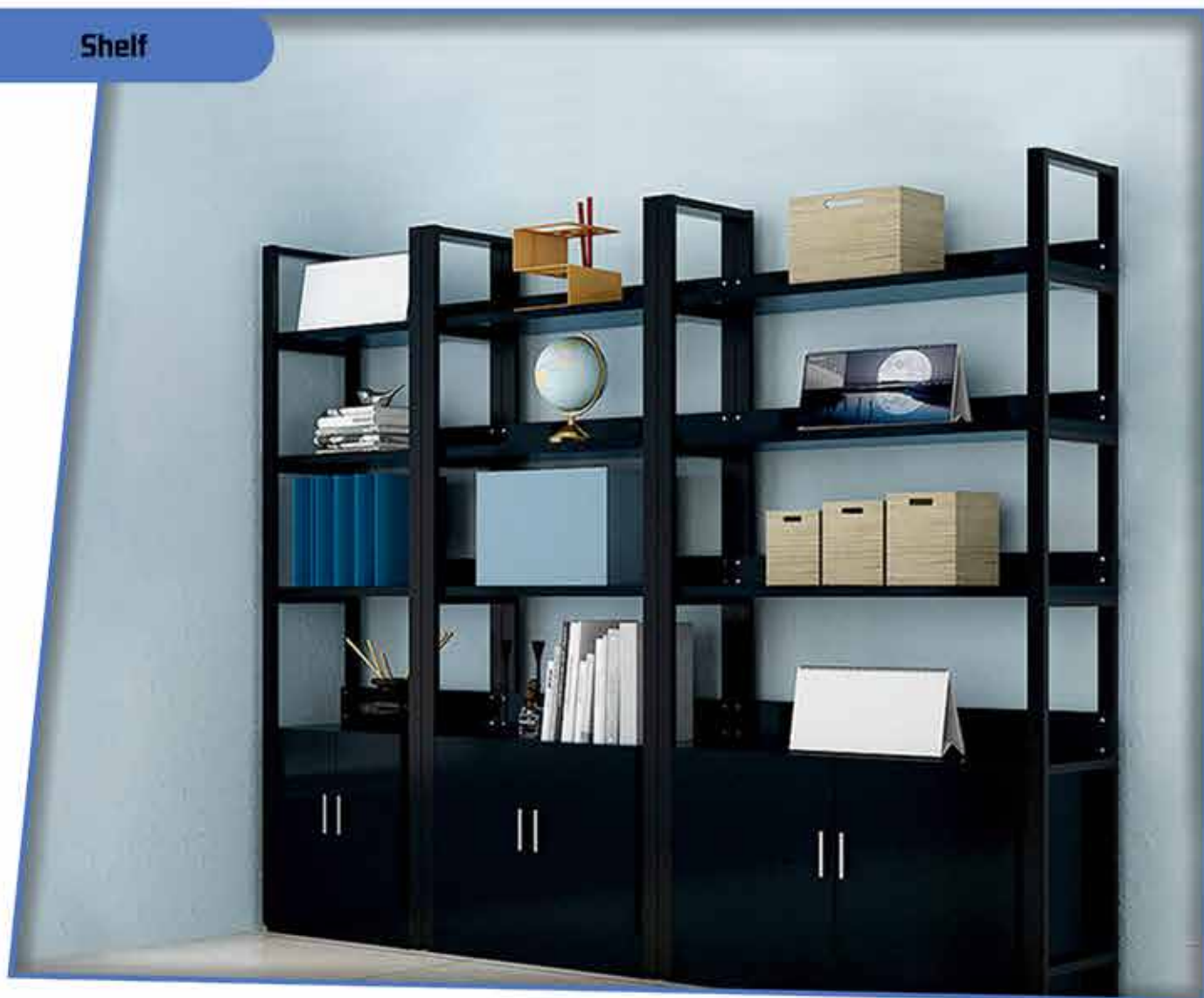
Item No.: TCG-032 Size: 195cm x 90cm x 34.8cm